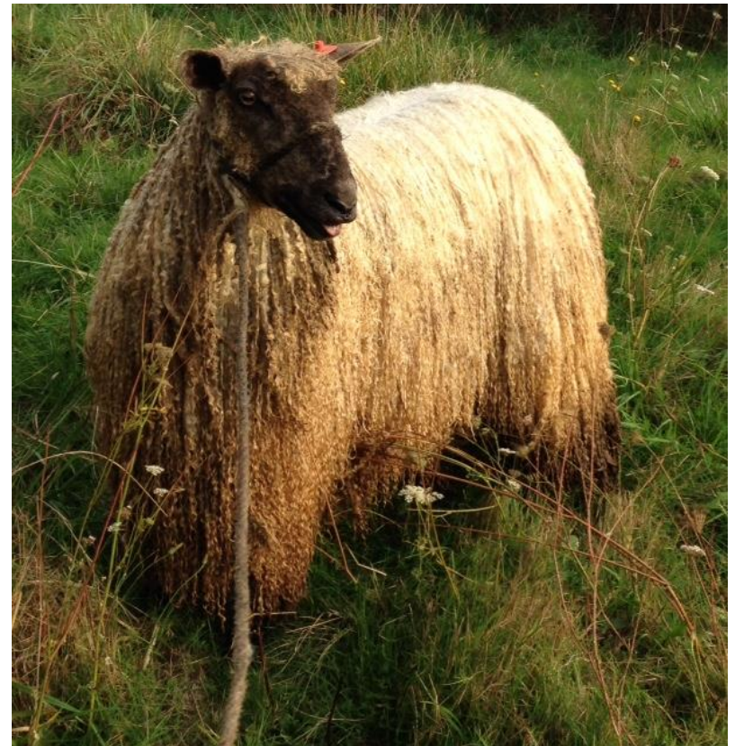
Lawrence Cottage Yearling Ewe

This meeting will be via free conference call. Please do come and and listen and participate. Help shape our association! An agenda and call in information will follow in your email.